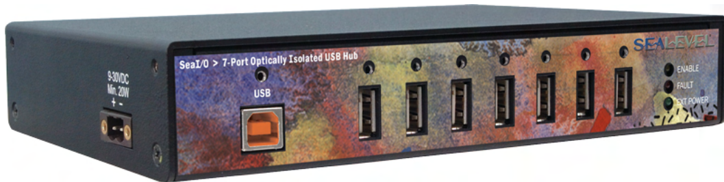
Isolated 7-Port USB Hub with SeaLATCH™ Ports